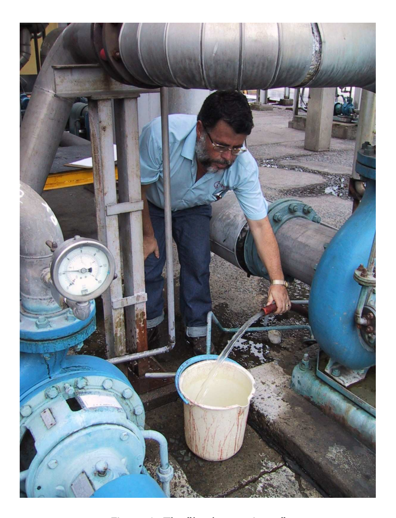
Figure 1: The "bucket engineer"

Bucket and stopwatch are simple and accurate measuring tools. To determine water losses collect a specified amount of process water for a specific period of time (for example ten litres in a minute).